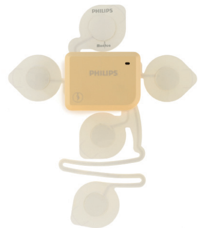
Avalon CL Fetal & Maternal Pod and Patch

Assistant Divisional Director of Midwifery Gloucestershire Royal Hospital