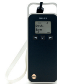
Avalon Wide Range Pod